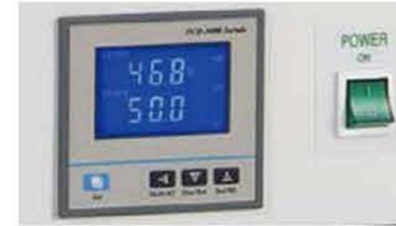
Microprocessor controller with LCD display, accurate and reliable.