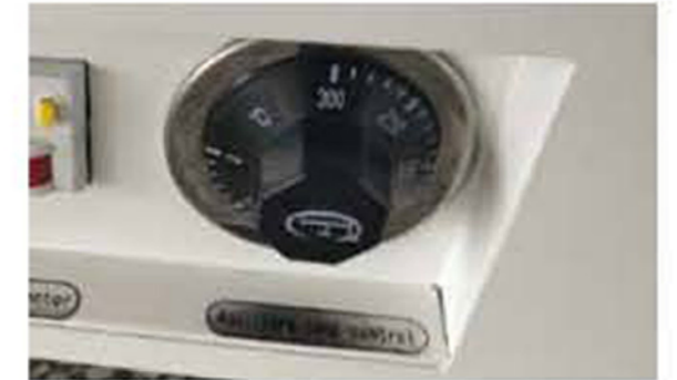
Equipped with spare temperature control which ensures the product work normally even the main temp.control failed.