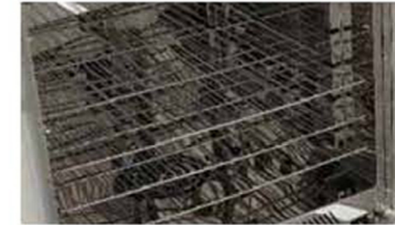
High quality stainless steel chamber, removable shelf, easy-to-clean.