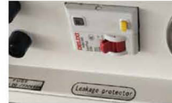
Equipped with leakage protection.