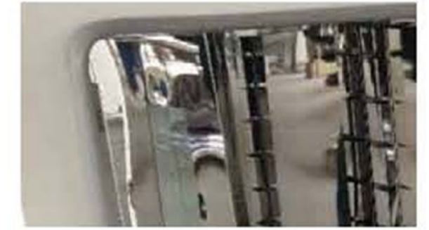
Silicon sealing ring for reliable sealing.